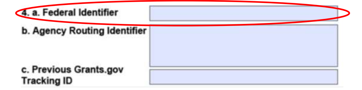
Figure 1. Enter your eBRAP log number in Block 4a.

Block 4a – Federal Identifier Box. Enter your eBRAP log number assigned during pre-application (LOI) submission.