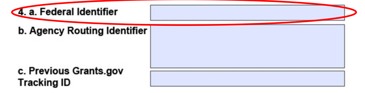
Figure 1. Enter the eBRAP log number in Block 4a.