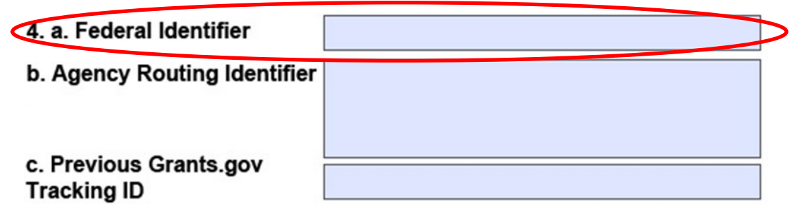
Figure 1. Enter the eBRAP log number in Block 4a.